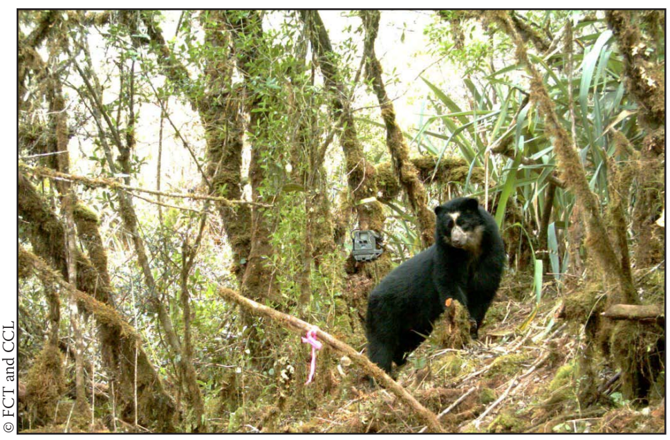
Andean bear photo-captured in camera trap

biodiversity on 1,935 ha of communally-owned montane forest, the company will construct and equip a new cheese factory in the community. Concurrent with these efforts, FCT partnered with a national initiative led by Ecuador's Ministry of Environment called Socio Bosque, aimed at providing private landowners and indigenous communities with direct remuneration in return for the conservation of native habitats. These programs are conserving ~2,500 ha of tropical montane evergreen forest and páramo landscapes throughout the southern region of Sangay National Park.