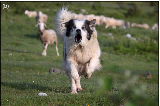
Figure 3. Livestock-guarding dog (a) protecting sheep and (b) charging the approaching photographer.

Peebles et al. 2013; Wielgus and Peebles 2014; Fernández-Gil et al. 2016). The non-lethal methods that have been tested (LGD, fladry, night enclosures) were not associated with similar negative results.