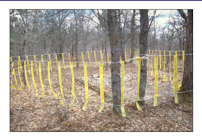
Figure 4. An experimental plot containing a road-killed deer carcass surrounded by a treatment of fladry – a flagging method used to deter wolves (Shivik et al. 2003).

ers trained the owners in verification techniques and issued field kits to improve verification (McManus et al. 2015).