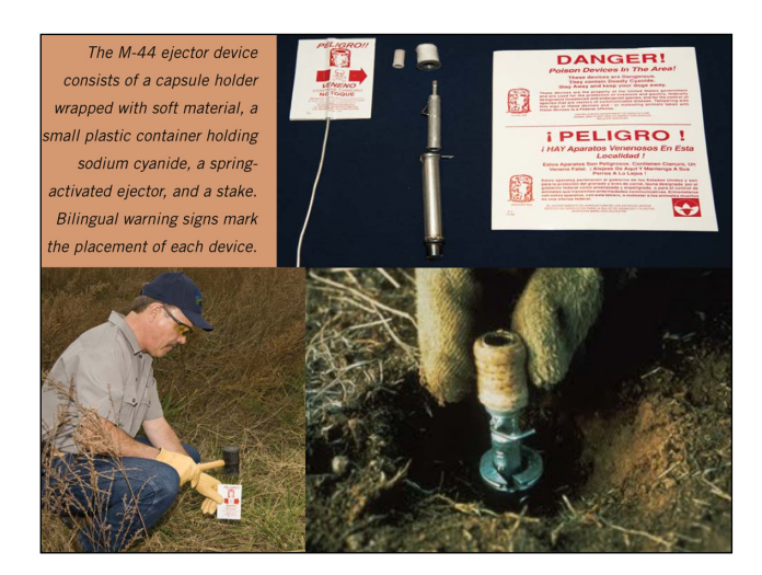
Figure 2. M-44 explosive poison (sodium cyanide) delivery device for killing wildlife (Factsheet May 2010, US Department of Agriculture Wildlife Services; http://l.usa.gov/28Iv69N).

considered it in combination with another study to qualify as a BACI design. Cooley et al.'s (2009 a,b) study of cougars (Puma concolor) strengthened the inference in Peebles et al. (2013) when looking only at the twocounty comparison in the latter paper. Specifically, Cooley et al. (2009 a,b) documented that hunting cougars led to demographic changes in a heavily hunted county and not in another county with much lower rates of cougar hunting (also see White et al. 2011). Later, Peebles et al. (2013) showed that livestock losses rose annually in correlation with the number of cougars taken by hunters but only in the county that experienced changes in cougar demography. We therefore judged that the two studies together provided the causal mechanism and the BACI design needed to identify it as a silver standard test in Table 1.